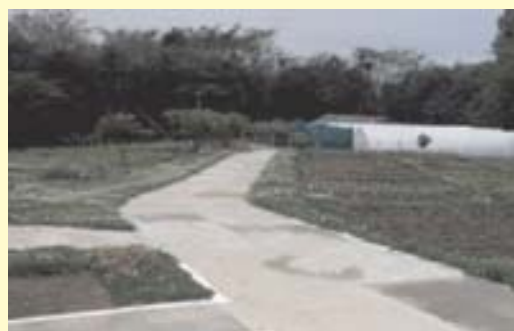
Roads in nursery

A proper planning for roads and paths inside the nursery will not only add beauty, but also make the nursery operations easy and economical. This could be achieved by dividing the nursery into different blocks and various sections. But at the same time, there should not be wastage of land by unnecessarily laying out of paths and roads. Each road/ path should lead the customer to a point of interest in the nursery area.