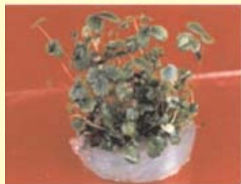
Proliferation of explant

2) Shoot multiplication- The established explants are subcultured after 2-3 weeks, on shoot multiplication medium. The medium is designed in such a way to avoid the formation of callus, which is undesirable for true-to-type multiplication of plants. Thus, careful use of auxins like NAA, 2,4-D and cytokinins like BAP, kinetin is done in culture medium. It is well-established fact that cytokinins enhance shoot multiplication.