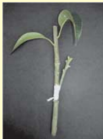
Side grafting in mango

3. Approach Grafting : This method of grafting is termed as approach grafting, as the rootstock is approached to the scion, while it is still attached to the mother plant. Alternatively, the mother plants are trained to be low headed and the stock is sown under their canopy. Last week of July or the first week of August is the best period for approach grafting. In this method, the diameter of rootstock and scion should be approximately the same. A slice of bark along with a thin piece of wood about 4 cm long is removed from matching portions of both the stock and the scion. They are then brought together making sure that their cambium layers make contact at least on one side. These grafts are then tied firmly with a polythene strip or any other tying material. The stock and scion plants are watered regularly to hasten the union. The union is complete in about 2 to 3 months. The method is commonly followed in mango. This method is also called inarching.