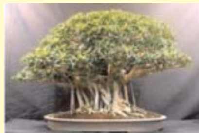
Bonsai of banyan tree

Bonsai is a Japanese art of growing huge trees in containers under controlled nutrition. Bonsai can be