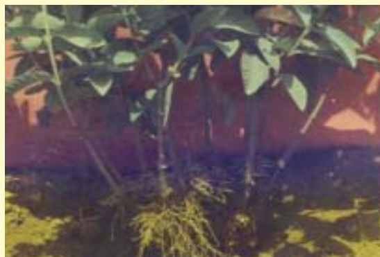
Stooling in guava

prior to their permanent removal from the mother plant. At the time of separation, a few leaves or small shoot is retained. It is also advisable to plant these rooted layers in nursery for close attention than to plant them directly in field. These layers can be planted in the fields during the following year in February-March or September-October.