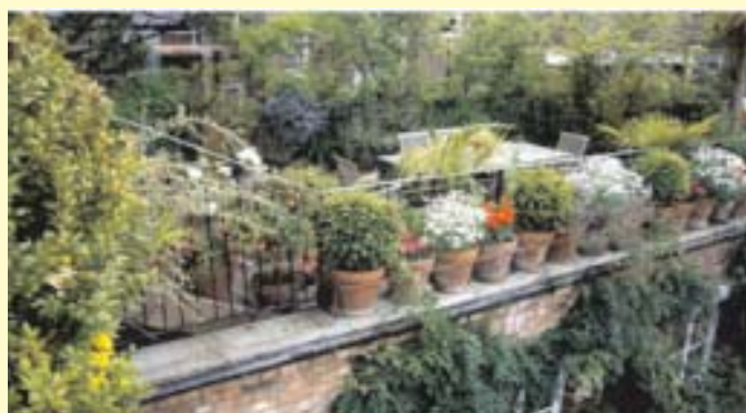
A view of roof garden

In big towns and cities, availability of cultivable land is a big problem. In spite of this, horticulture can be taken as one of the enterprises in such areas as well by growing horticultural plants on the roof of house or balcony. Roof garden is one of popular alternatives in urban areas, because of the limited available space in the grounds of a house. However, care should be exercised to confirm that the roof of the house is strong enough to bear the heavy load of soil and potted plants. In roof garden, potted plants like cacti and succulents, chrysanthemums, dahlias, orchids, bougainvillea, roses, seasonal flowers and several kinds of shrubs and herbs can be