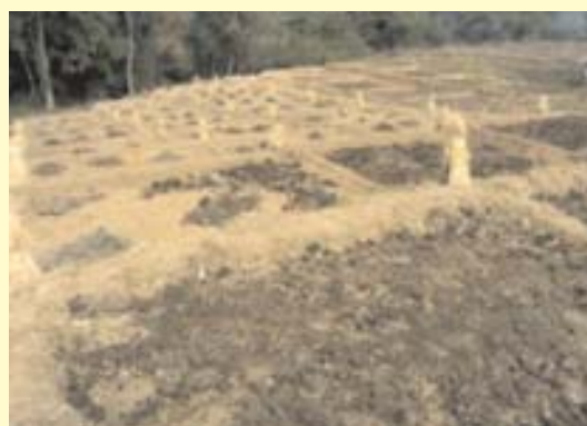
Preparation of mixes in the nursery

For better success of nursery plants, a good potting mixture is necessary. The potting mixtures for different purposes can be prepared by mixing fertile soil, well rotten farm yard manure, leaf mold, etc., in different proportions. The potting mixture may be prepared well in advance by adding sufficient quantity of super phosphate for better decomposition and solubilization. The potting mixture may be kept near the potting yard, where potting is done. Construction of a potting yard of suitable size facilitates potting of seedlings or grafting/budding operations even on a rainy day.