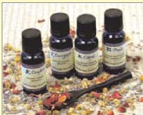
Essential oils made from flowers