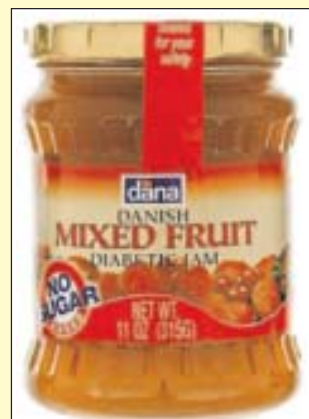
Mixed fruit jam

Jam is prepared by boiling the fruit pulp with sufficient quantity of sugar to a reasonably thick consistency, firm enough to hold fruit tissues in position. It should contain not less than 68.5 per cent soluble solids as determined by a refractometer. Jam may be made from a single fruit (apple, strawberry, banana, pineapple etc.) or from a combination of two or more fruits. The preparation of jam requires several unit operations viz., selection of fruit, preparation of fruit, addition of sugar, addition of acid, mixing, cooking, filling, closing, cooling and storage.