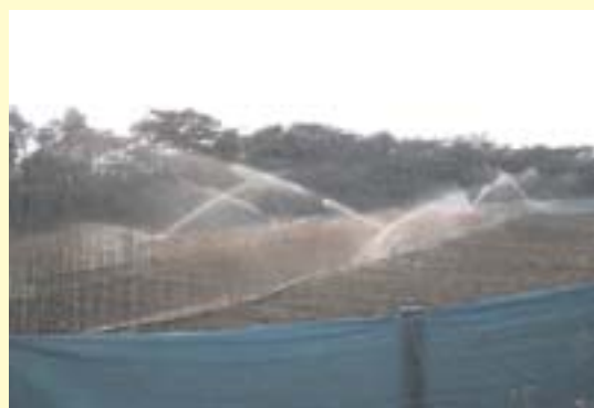
Use of sprinkler for irrigation in nursery

Nursery plants require abundant supply of water for irrigation. Hence, provision for assured irrigation facilities must be made well in advance to obtain better growth and success in the production of planting material. In areas with low water table and frequent power failures, water storage tanks/ rain water harvesting tanks should be constructed to provide life saving irrigation to the nursery plants. Since water scarcity is a limiting factor in most of the areas in the state, a well laid out PVC pipeline system will solve the problem to a greater extent. An experienced agricultural engineer may be consulted in this regard for layout of pipeline. This facilitates efficient and economic distribution of irrigation water to different blocks in the nursery and also reduces the seepage losses.