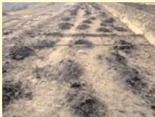
Preparation of nursery beds

These should be located in an open place which receives sufficient sunlight. Beds of 1-meter width of any convenient length are to be made. A working space of 60cm between the beds is necessary. This facilitates ease in sowing of seeds, weeding, watering, spraying and lifting of seedlings. Irrigation channels are to be laid out conveniently. Alternatively, sprinkler irrigation system may be provided for irrigating the beds, which offers uniform germination and better seedling growth.