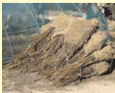
Packed bundles of nursery plants

Nursery production is a programme, which requires proper planning and monitoring for obtaining quality planting material and better returns. This can be performed by better coordination and linkages with the experts in Universities, State Department of Horticulture, reputed nurserymen as well as concerned stakeholders.