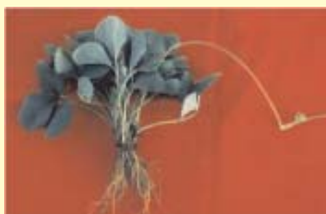
A view of runner production in strawberry

1. Runners : A runner is a specialized stem that develops from the axil of a leaf at the crown of a plant. It grows horizontally along the ground and forms a new plant at one of the nodes (e.g. strawberry). The runner production is favoured by long day and high temperature. The daughter plants are separated and used as new planting material.