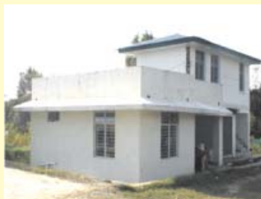
A view of office building in nursery