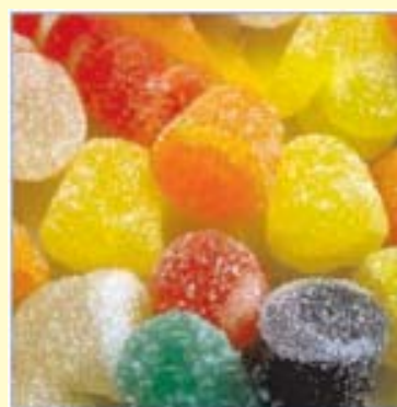
Candy with different colours