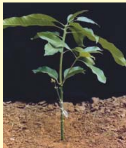
Veneer grafting in mango

5. Veneer Grafting : In this method, a shallow downward cut of about 4 cm long is given on the rootstock at a height of about 15-20 cm from the ground level. At the base of this cut, a second short downward and inward cut is made to join the first cut, so as to remove a piece of wood and bark. The scion is prepared exactly as in side grafting. The cuts on the rootstock and scion shoot should be of the same length and width so that the cambial layers of both components match each other. Then, the prepared scion is inserted into the rootstock and tied securely with polythene strip. After the union is complete the stock is cut back, leaving time for doing veneer grafting.