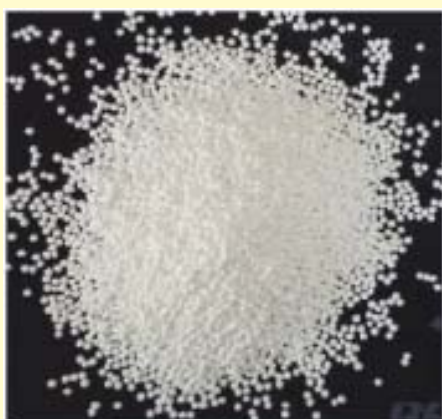
Sodium benzoate granules

The major limitations of sulphur dioxide are : (a) it cannot be used in the case of some naturally coloured juices like those of phalsa , jamun , pomegranate, strawberry, coloured grapes, plurn, etc., on account of its bleaching action, (b) it cannot also be used for juices, which are to be packed in tin containers, because it not only corrodes the tin causing pinholes, but also forms hydrogen sulphide, which has a disagreeable smell and reacts with the iron of the tin container to