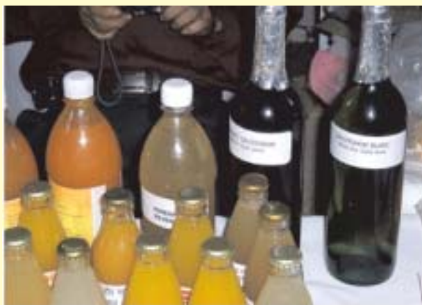
Fruit juices prepared from different fruits

iii) Fruit Juices/Beverages: Fruit juices are preserved in different forms such as pure juices and beverages. Fruit beverages can be classified into two groups: