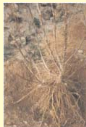
Rooting in apple stool plant