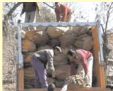
Transport of nursery plants

It is an important component of the nursery. A huge quantity of organic manure is required in the nursery for the production of healthy planting material. Therefore, it is advisable to construct vermi-compost pits, where the weeds and waste material can be utilized for the production of organic manure at the nursery site itself. It will reduce the expenditure to be incurred on the purchase of manures. It should be constructed near the potting shed.