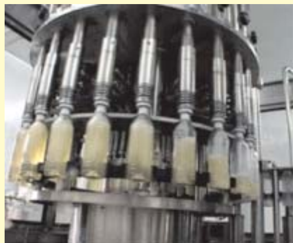
A view of bottling in a fruit processing plant

The main causes of spoilage of horticultural produce are microbiological (bacteria, yeasts, moulds), chemical (enzymatic discolouration, rancidity, oxidation) and physical (bruising) factors. There are many reasons for processing foods besides the development of a business with a good return on investment for the owners such as to prevent post harvest losses, to eliminate waste, to preserve quality, to preserve the nutritive value of the raw materials, to make seasonal horticultural produce available throughout the year, to put them in convenient form for the user, to safely put the food away for emergencies and to develop new products and to increase the value of the product.