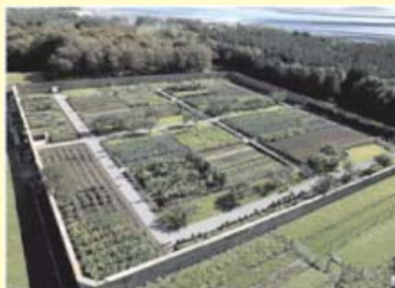
A view of modern kitchen garden

A well maintained kitchen garden can provide fruits, vegetables and cut flowers throughout the year. In kitchen garden, intensive system of planting is followed. On bunds, vegetables like carrot, radish, and in the fields cabbage, cauliflower, and dhania can be easily grown. Near the wall of house, some trailing type bean should be grown. Among fruits, choice is limited but strawberry, Amrapali mango, Kagzi Kalan lemon and papaya can be easily grown. Similarly one grapevine can be trained to wall of house. On side rows of kitchen garden, a row of roses, gladiolus or chrysanthemum or any other seasonal flowers can be grown to make kitchen garden more attractive and to meet the demands of your family.