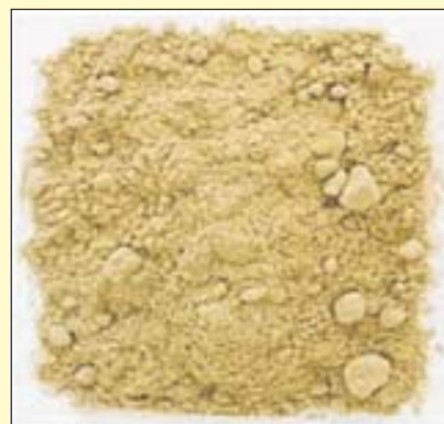
Amchur : a dried mango product