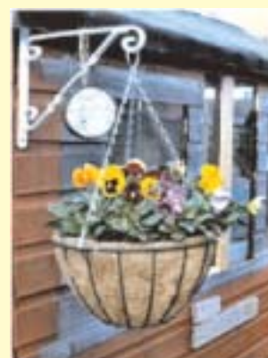
Annuals in hanging basket

Hanging baskets with training of cascading plants are suited for indoors as well as outdoors. Such baskets can be hanged at the entrance of the house or can be kept in the lawn or in a hall or can be suspended from trees, electric poles or fences. Plants like petunias, salvia, pansies and geranium are suitable for hanging baskets.