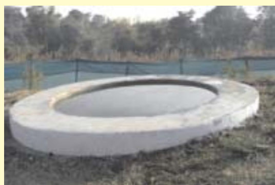
Water storage tank in nursery

The nursery should have a well-maintained progeny orchards or mother plant block/scion bank of commercial and recommended varieties. The mother plants for establishing progeny orchards should be obtained preferably from the original research institute from where these are released or from a reputed nursery. It is well realized that the success of any nursery largely depends upon the initial selection of progeny plants or mother plants for further multiplication. Any mistake made in this aspect will result in loss of the reputation of the nursery. A well managed progeny block or mother plants block will not only create confidence among the customers but also reduces the cost of production and increases the success rate of grafting/ budding/