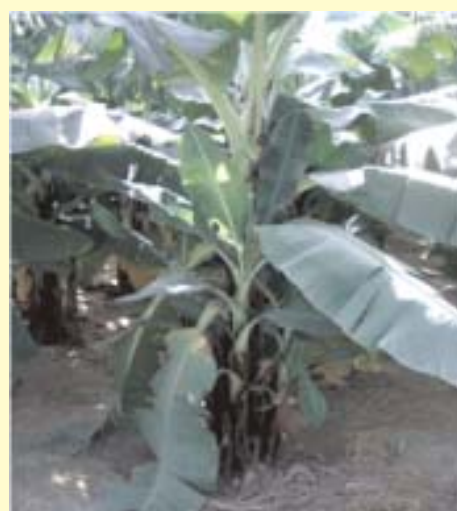
Formation of suckers at the base of banana plant.

2. Suckers : A shoot arising on an old stem or underground part of the stem is known as suckers. In other words, a sucker is a shoot, which arises on a plant below the ground. These shoots, when separated from the mother plant and transplanted produce adventitious roots. The capacity of a plant to form suckers varies from plant to plant, variety to variety and is even climate dependent. The sucker formation is common in fruit plants like pear and banana. In banana, sword suckers are commonly used for propagation of plants.