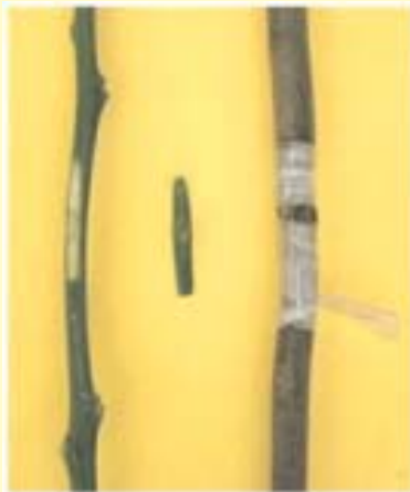
T budding in citrus

cut and flaps of the bark are loosened with ivory end of the budding knife to receive the bud. After the 'T' out has been made in the stock, the bud is removed from the budstick. To remove the shield of bark containing the bud, a slicing cut is started at a point on the bud-stick about 1.25 cm below the bud, continuing underneath about 2.5 cm above the bud. A second horizontal cut is then made 1.25 to 2 cm above the bud, thus permitting the removal of the shield piece. The shield is removed along with a very thin slice of wood. The shield is then pushed under the two raised