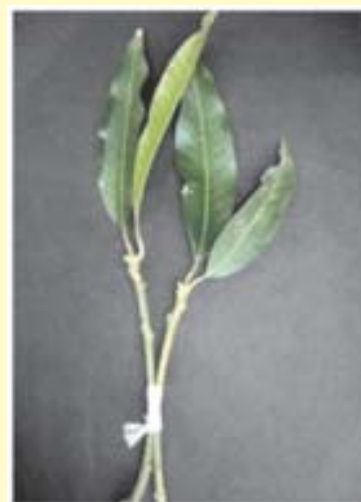
Approach grafting in mango

1. Tongue Grafting : This method is commonly used when the stock and scion are of equal diameter. First, a long, smooth, slanting cut of about 4 to 5 cm long is made on the rootstock. Another downward cut is given starting approximately 1/3rd from the top and about 2 centimeter in length. Similar cuts are made in the scion wood exactly matching the cut given in the rootstock. The scion having 2 to 3 buds is then tightly fitted with the rootstock taking care that the cambium layer of at least one side of the stock and scion unites together. This is then wrapped tightly with polythene strip.