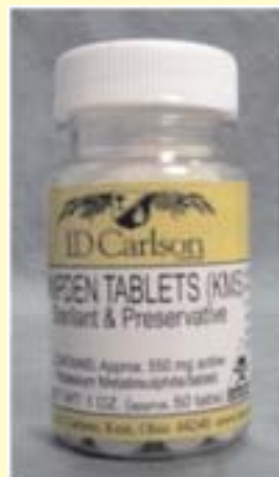
A bottle of potassium metabisulphite (KMS)

The advantages of using sulphur dioxide are : (a) it has a better preserving action than sodium benzoate against bacterial fermentation, (b) it helps to retain the colour of the beverage for a longer time than sodium benzoate, (c) being a gas, it helps in preserving the surface layer of juices also, (d) being highly soluble in juices and squashes, it ensures better mixing and hence their preservation, and (e) any excess of sulphur dioxide present in the food them can be removed either by heating the juice to about 71°C or by passing air through it or by subjecting the juice to vacuum.