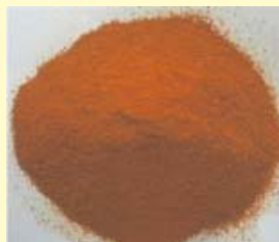
Natural colorant from yellow capsicum