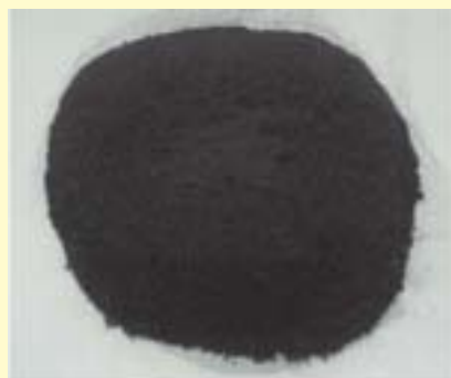
Natural colorant from black carrot