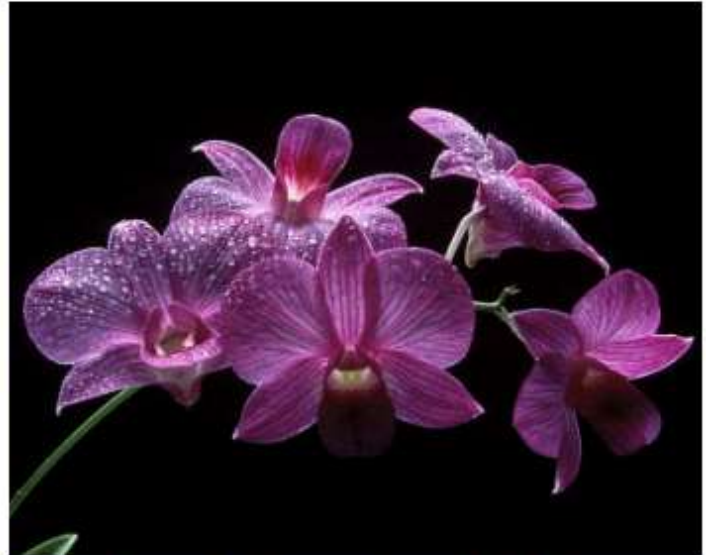
Dendrobium Candy Stripe