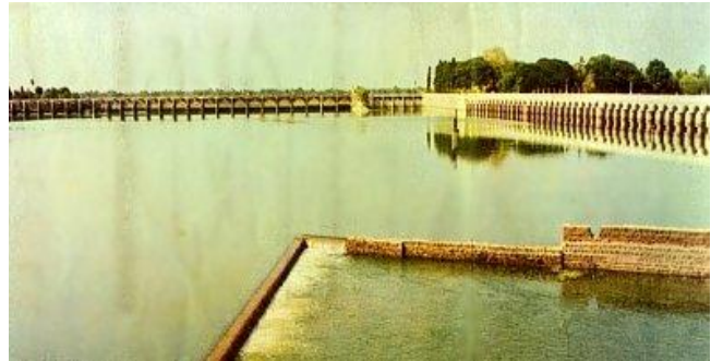
Grand Anicut Dam on river Caveri (1st-2nd Century CE) is one of the oldest water-regulation structures in the world still in use.

Despite some stagnation during the later modern era the independent Republic of India was able to develop a comprehensive agricultural program.